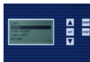
Ergonomic operating panel